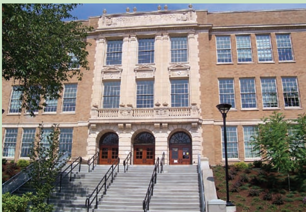
Graffiti Protection: Roosevelt High School, Seattle, Washington (Historic Register)