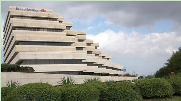
Water Repellent: The Pyramid Building, San Antonio, Texas

By applying Professional® Water Sealant & Anti-Graffitiant prior to vandalism, it establishes a long-lasting barrier which prevents paint penetration. This allows for repeated cycles of graffiti removal when Professional Phase II Cleaner is used.