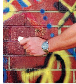
Agitate with brush, if necessary.