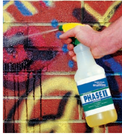
Spray tagged surface with Phase II Cleaner.